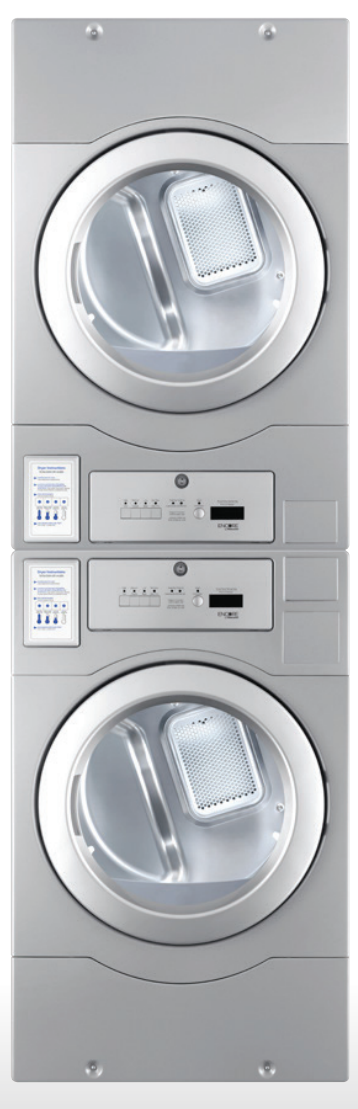
Available in Electric and Gas.